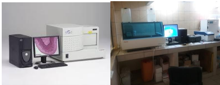
Figure 7: Telepathology Station and Immunohistochemistry Station

This is the first and only Laboratory of West Africa with complete and automated systems for telepathology and immunochemistry. (Figure 7)