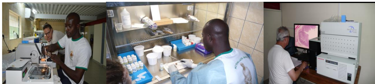
Figure 3: Training Of Local Technical Personnel in Histological Techniques and Preparation of Telepathology

After completing the laboratory, we have trained the staff (Figure 3).