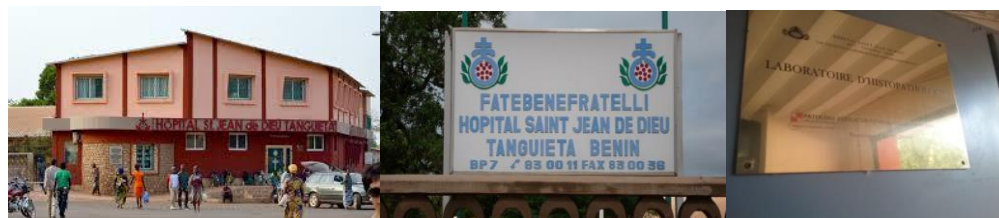
Figure 1: Hospital entrance and laboratory entrance

At the Histopathology Laboratory of Saint John of God Hospital in Tanguieta – Benin ( Figure 1 ), after three years of activity and about 500-600 cases analyzed a diagnostic critical point has emerged.