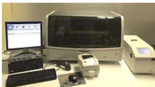
Figure 4: Complete Station Autostainer 480S - Thermo Scientific

instrument and antibodies were purchased with funds from the UTA Onlus organization and the Bio-Optica company.